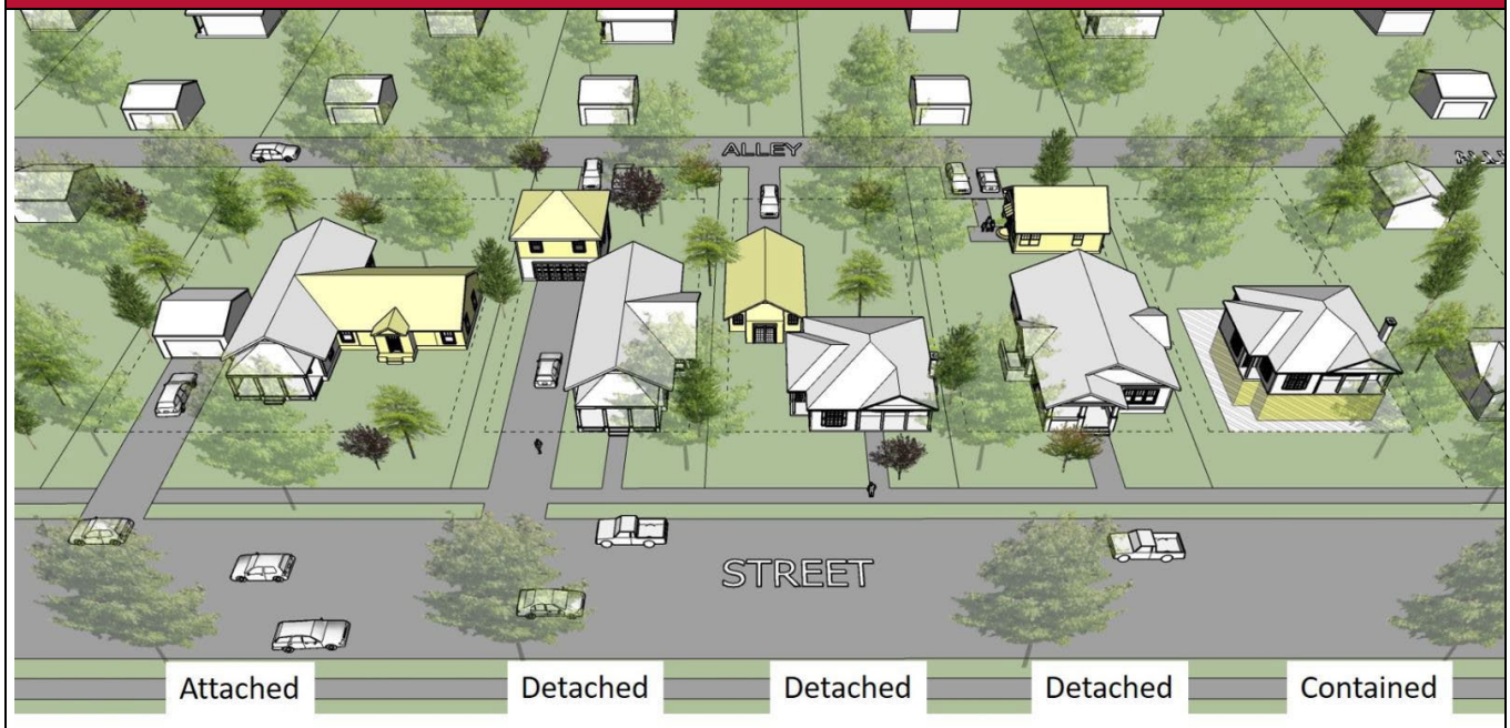
Figure 10-1-1.7.1 ADU Types (to be updated)