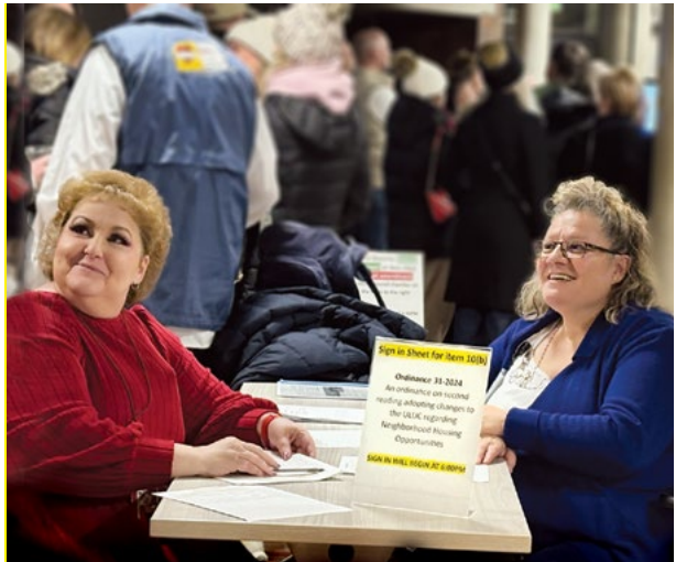
Hundreds attended the January 7 city council meeting.