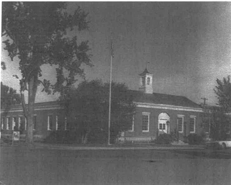
HP3 South and east sides. Historic photo ca 1962. View to northwest.