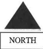
Sketch Map – Littleton Post Office