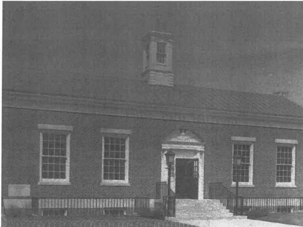
HP2 Littleton Post Office. East side. Historic photo ca 1940-1950. View to west.