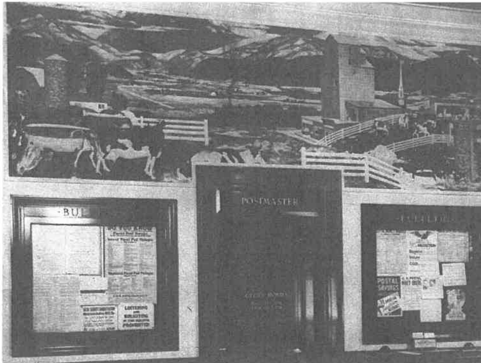
HP4 Littleton Post Office interior showing mural. Historic photo ca 1948.