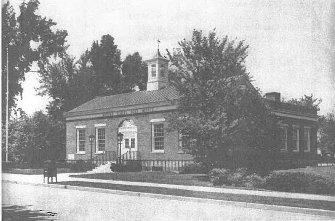
HP1 Littleton Post Office. East and north sides. Historic photo ca. 1948. View to southwest.